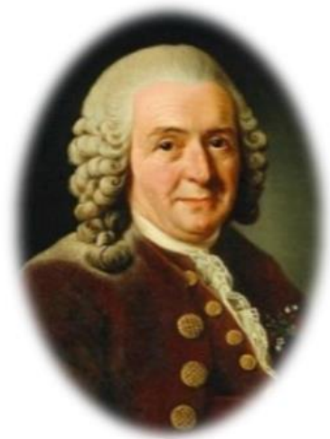
Carl Linnaeus 1707- 1778